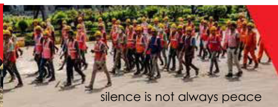
silence is not always peace