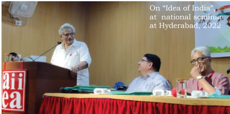
On "Idea of India" at national seminar at Hyderabad, 2022