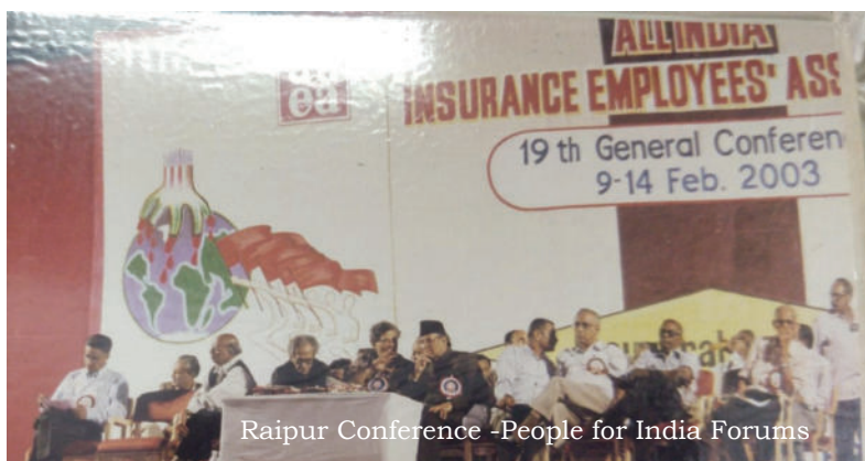
Raipur Conference -People for India Forums

Com. Yechury was an outstanding leader of the left movement. He was elected as the General Secretary of the CPI (M) in 2015 and continued