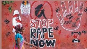
India is Failing its Daughters