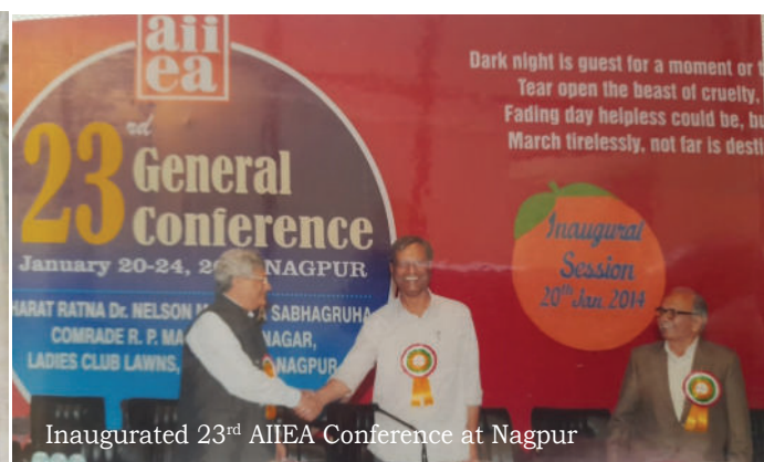
Inaugurated 23 rd AIIEA Conference at Nagpur