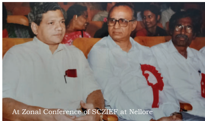
At Zonal Conference of SCZIEF at Nellore

In 1999, when the AIIEA and its units were in the thick of struggle against the opening up of the insurance sector to private participation, he inaugurated the Zonal Conference of SCZIEF at Nellore and through his submissions gave necessary confidence for the movement to take the struggle forward. He was the Special Guest in the 2003 Raipur Conference of the AIIEA, which was inaugurated by former Prime Minister of India Late Shri V.P. Singh. Just a few months earlier in Bangalore an experiment was attempted to defend the public sector institutions with the involvement of technocrats, bureaucrats, functionaries of the civil society and the trade unions under the banner of Citizens Forum against privatization. The AIIEA leadership at Bangalore had played an important role in this experiment. Com Sitaram Yechury was the main speaker of this program. Impressed by this program, Com Yechury