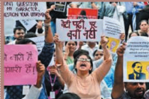
बेटी, क्या तुझे न्याय मिलेगा, वो भी मरने के बाद?