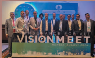
Insurance Industry in the Melting Pot