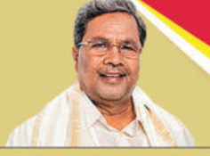
ಶ್ರೀ ಸಿದ್ದರಾಮಯ್ಯ ಸರ್ಕಾರದ ಮುಖ್ಯಮಂತ್ರಿಗಳು