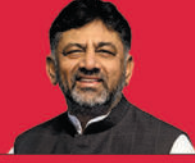
ಶ್ರೀ ಡಿ.ಕೆ.ಶಿವಕುಮಾರ್ ಮಾನ್ಯ ಉಪಮುಖ್ಯಮಂತ್ರಿಗಳು