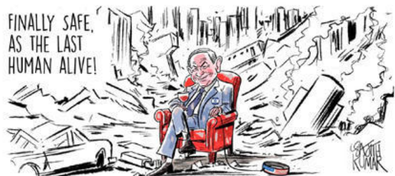
Cartoon courtesy: Sajith Kumar, Deccan Herald

In conclusion, imperialist aggression in the present context operates through a sophisticated integration of economic, military and political tools. The tariff war, the attack on Iran and abduction of Nicolas Maduro reveal a comprehensive gameplan aimed at maintaining dominance amid shifting global power dynamics. While such strategies may yield short-term advantages for the imperialists, they carry long-term consequences for global stability, sovereignty and rule-based world order. Today, Benjamin Franklin's warning comes back to haunt, "There never was a good war or a bad peace".