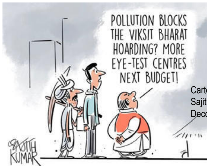
Cartoon courtesy: Sajith Kumar, Deccan Herald

A genuinely people-centred alternative is both possible and necessary—one that strengthens public sector institutions, expands decent employment opportunities, safeguards household savings, offers meaningful tax relief to middle- and working-class families, and makes substantial investments in education, healthcare and social security. Unless economic growth is aligned with social justice and inclusive development, progress will remain muffled—benefiting a privileged minority while leaving the majority behind.