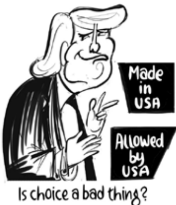
Cartoon courtesy: E P Unny, Indian Express

Donald Trump came to power for the second time promising to end America’s endless wars. That promise now lies in ashes in West Asia. The mercurial far-right