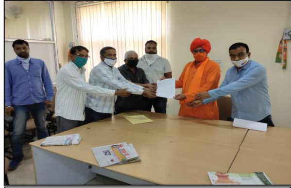
Sri Sumedhanand Saraswati, LS, BJP (Sikar)