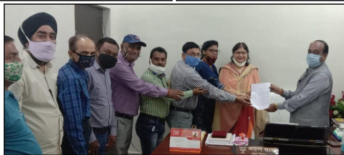
Sri Arun Sao, LS, BJP (Bilaspur)