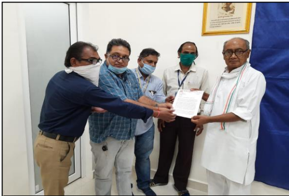
Shri Digvijay Singh, RS, Congress (Bhopal)

The Secretariat of AIIEA that met through video conferencing on 2 nd August 2020 decided to intensify the agitation on the issue of listing of LIC and its disinvestment. The Secretariat called upon our units to meet Members of Parliament, Chief Ministers of States and heads of political parties all over India and seek their support to our struggle. Subsequently, the Joint Front of Unions consisting of AIIEA, Federation of LIC Class I Officers' Associations and NFIFWI that met through video conferencing on 5 th August 2020 took similar decisions. Following these calls, our units have started the campaign in right earnest.