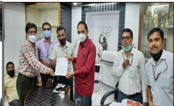
Sri Bidyut Baran Mahato, LS, BJP (Jamshedpur)