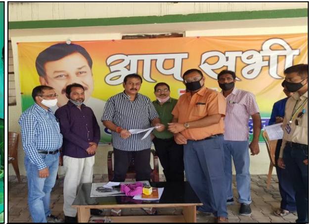
Sri Vijay Baghel, LS, BJP (Durg)