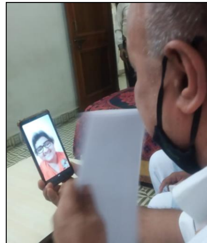
Sadhvi Pragya Singh Thakur, LS, BJP (Bhopal)

Sadhvi Pragya Singh Thakur through video conferencing and apprised her of the pernicious impact of LIC disinvestment. Comrades of Raipur Division (CZIEA) met Smt. Chhaya Verma , Rajya Sabha MP (Congress) and submitted the memorandum. They met Sri Amit Jogi , State President of Janata Congress and submitted the memorandum. Sri Jogi supported our demand and assured to move a resolution against the proposed IPO of LIC in the upcoming assembly session of Chhattisgarh assembly. Raipur comrades also met and submitted memorandum to Sri Charandas Mahant , Speaker of Chhattisgarh Assembly and Smt. Jyotsna Charandas Mahant , Congress MP (Lok Sabha) and apprised them of the issue. Both of them agreed with our understanding and assured to write to the Prime Minister and Finance Minister in support of our demand. Raipur comrades also met Lok Sabha MP from