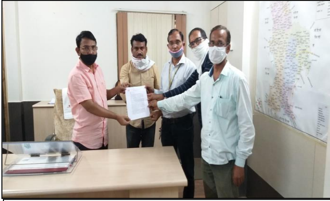
Sri Sunil Mendhe, LS, BJP, Bhandara-Gondia