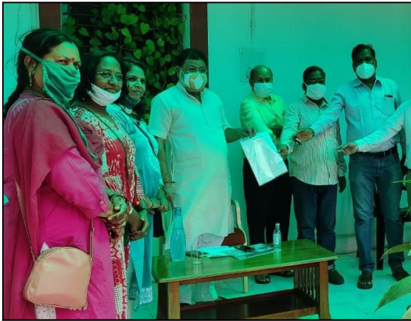
Sri Sunil Soni, LS, BJP (Raipur)